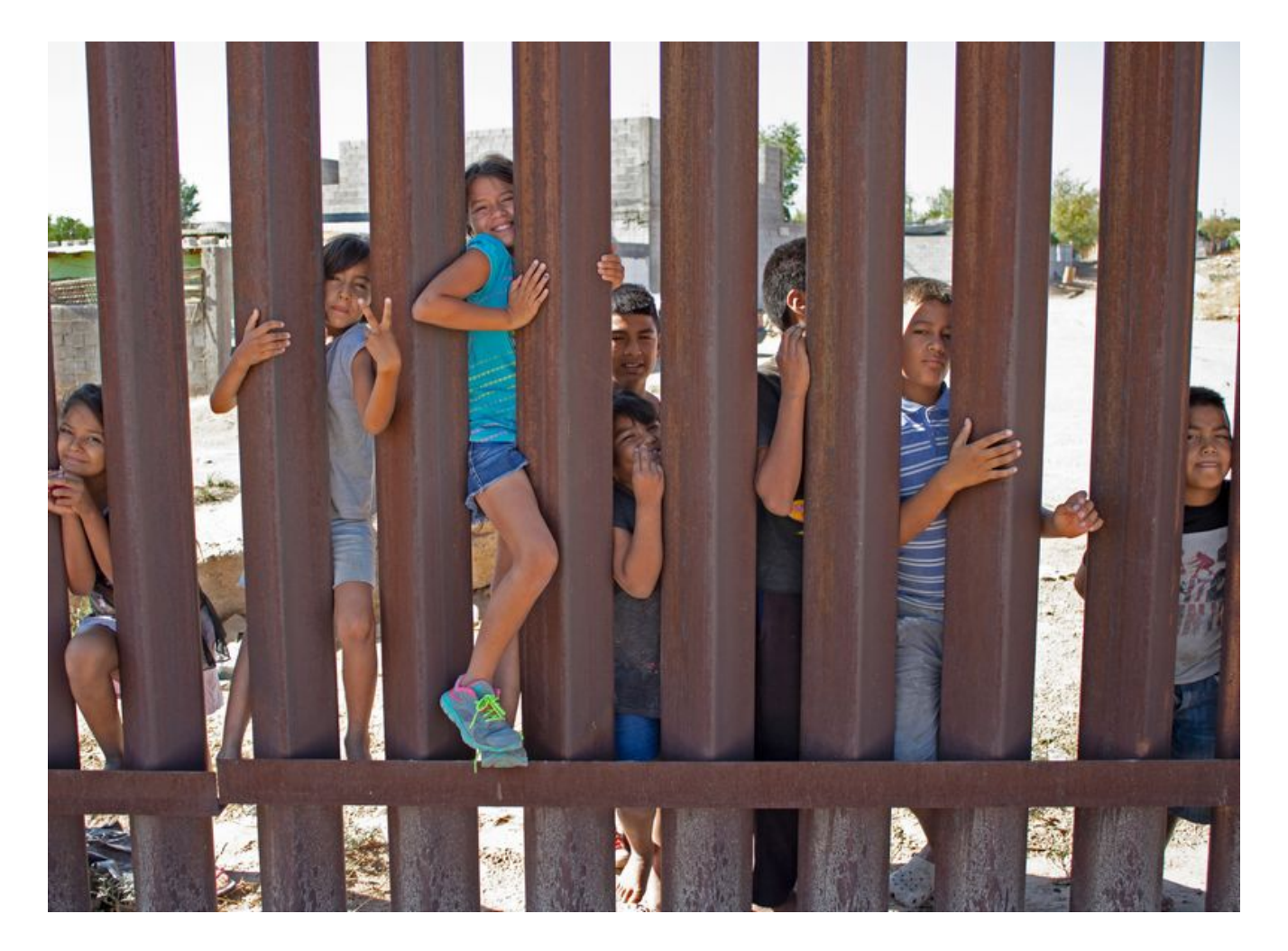
The first of the works was the Maria Auxiliadora Parish and Oratory , located in the 'Colonia Herrera'. Both the parish and the oratory deal with various problems in the area. Steps are being taken towards an agreement with the IOM